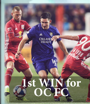
1st WIN for OCFC