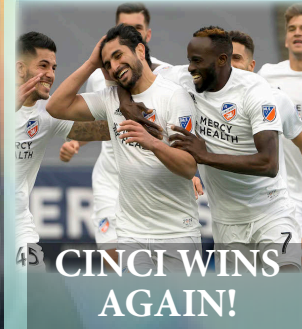
CINCI WINS AGAIN!